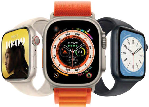
APPLE WATCH SERIES 8

With UHC Rewards, there's even more good to get. Employees have the option to enroll in Earn It Off . This is a payment option where they can get an Apple Watch for a low—or $0—upfront cost and pay the remaining cost with the rewards they earn over 12 months.